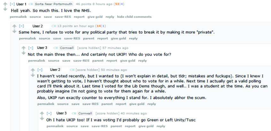
Figure 1: Excerpt from a comment tree where users discuss UK politics.

instead be influenced by the tree-like thread structure enforced by users responding to other comments.