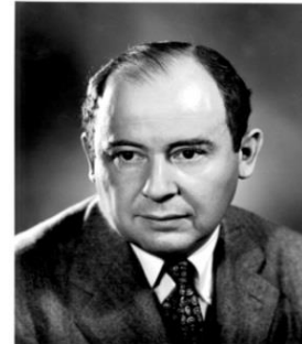
John von Neumann

“It is not necessarily true that the mathematical method is something absolute, which was revealed from on high, or which somehow, after we got hold of it, was evidently right and has stayed evidently right ever since.”