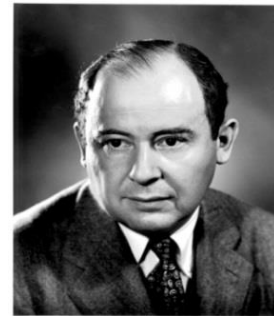
John von Neumann

“It is not necessarily true that the mathematical method is something absolute, which was revealed from on high, or which somehow, after we got hold of it, was evidently right and has stayed evidently right ever since.”