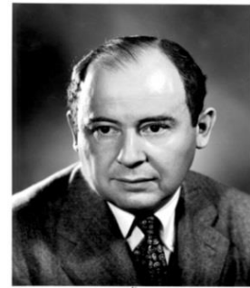
John von Neumann

“It is not necessarily true that the mathematical method is something absolute, which was revealed from on high, or which somehow, after we got hold of it, was evidently right and has stayed evidently right ever since. ”