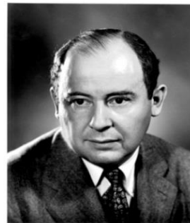
John von Neumann

According to John von Neumann, Gödel was “the greatest logician since Aristotle.” 64 However, [von Neumann 1961] expressed a very different mathematical philosophy than Gödel: