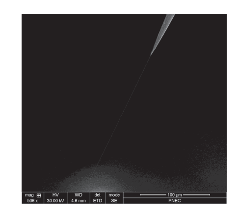
Figure 1: Scanning electron microscope image of sample 2.

The samples studied in this experiment are SiC nanowires (see figure 1) with lengths of several tenth of microns and diameters around 100 nm attached to sharp tungsten tips (see table 1). The experimental set up consists of a UHV chamber with a scanning electron microscope column. The sample is placed on a XYZ piezoelectric nanomanipulator in front of a counter electrode.