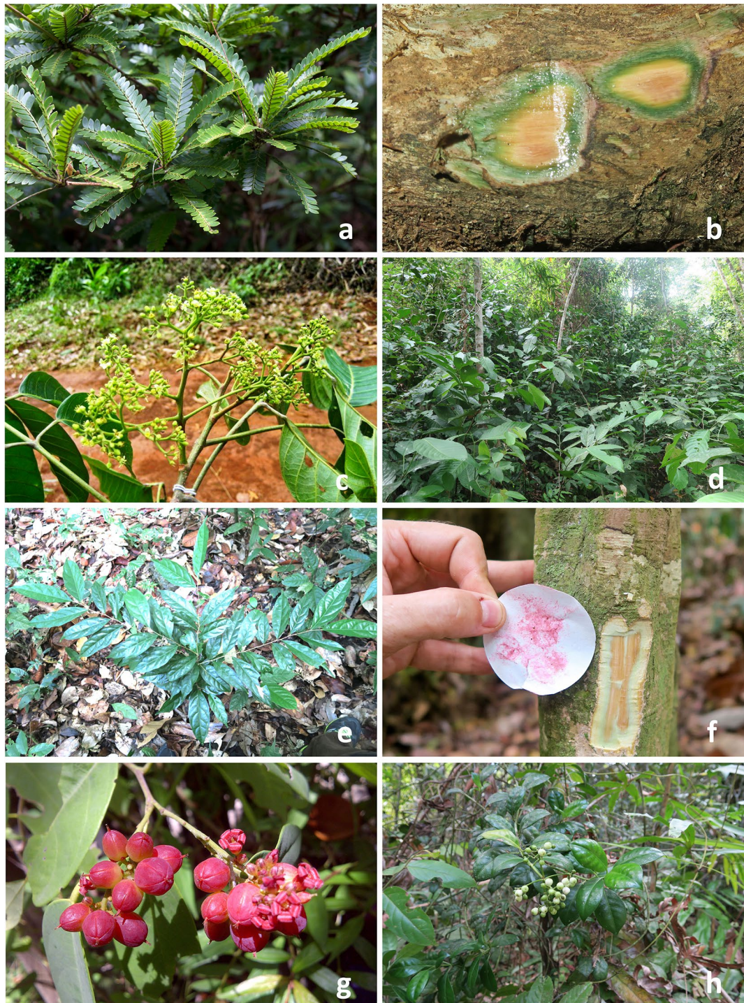
Fig. 3 Nickel hyperaccumulator plants in South and Southeast Asia: a Phyllanthus balgooyi (Phyllanthaceae) in Sabah, Malaysia is a small understorey tree. b Phloem sap exuding from Phyllanthus balgooyi contains up to 20 wt% Ni. c Knema matanensis (Myristicaceae) in Sulawesi, Indonesia; d Rinorea bengalensis (Violaceae) can be locally dominant in lowland forest, in Sabah, Malaysia. e Dichapetalum gelonioides subsp. tuberculatum (Dichapetalaceae) from Mount Silam, Malaysia. f Main stem of Dichapetalum gelonioides subsp. tuberculatum showing its Ni-rich phloem tissue with colorimetric response in dimethylglyoxime test-paper. g Sarcotheca celebica (Oxalidaceae) from Sulawesi, Indonesia. h Psychotria sarmentosa (Rubiaceae) is the only known Ni hyperaccumulator in South and Southeast Asia that is a climber