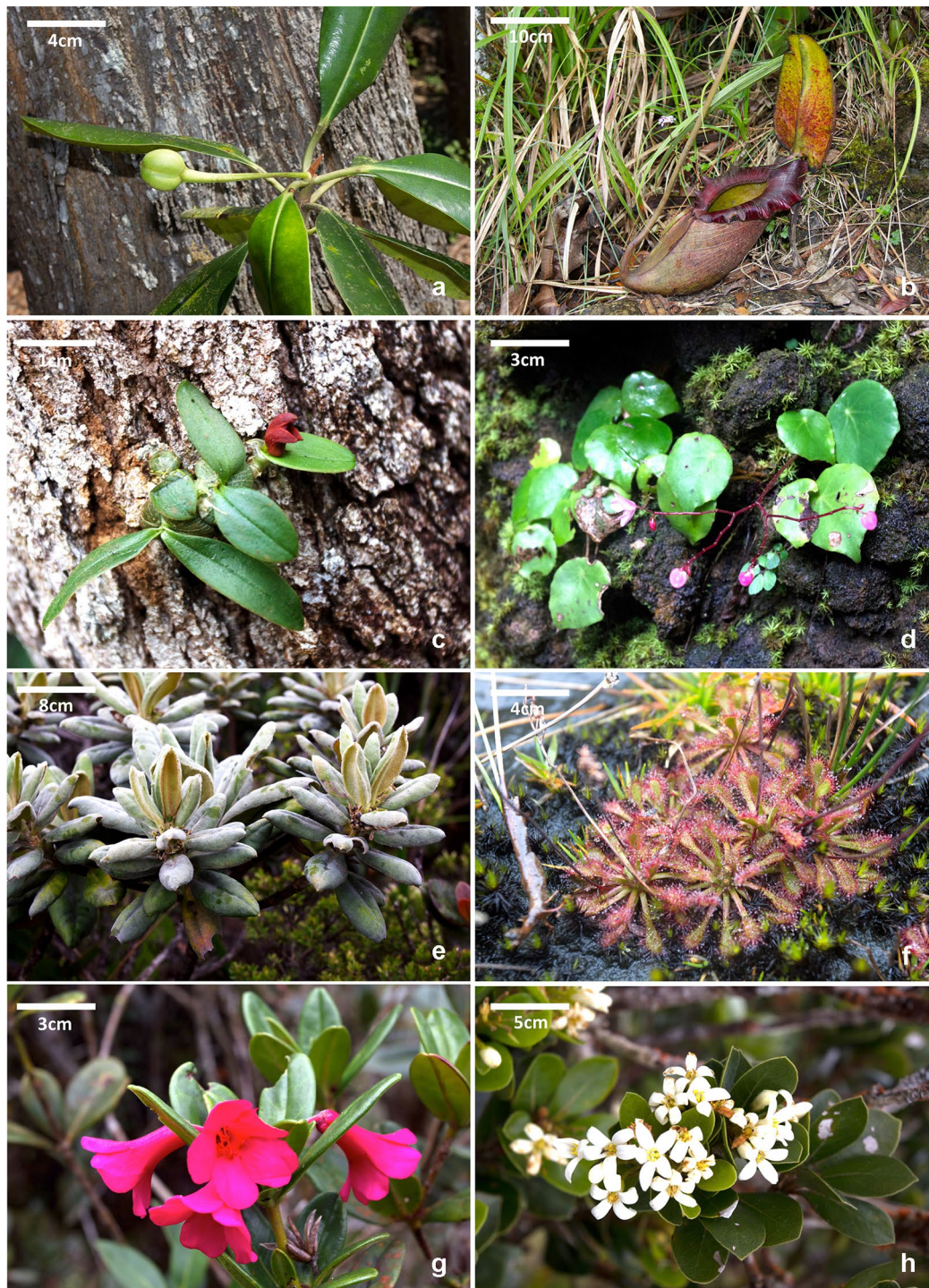
Fig. 4 Ultramafic edaphic endemics from South and Southeast Asia: a The monotypic tree Borneodendron aenigmaticum (Euphorbiaceae) is endemic to Sabah (Malaysia) on ultramafic soils in the lowlands. b The world's largest carnivorous pitcher plant, Nepenthes rajah (Nepenthaceae) is endemic to Kinabalu Park in Sabah where it occurs in the montane zone. c The epiphytic or lithophytic orchid Porpax borneensis (Orchidaceae) is restricted to ultramafic outcrops in Sabah, Malaysia. d The recently described Begonia moneta (Begoniaceae) occurs lithophytically in lowland ultramafic forest in Sabah, Malaysia. e Scaevola verticillata (Goodeniaceae) is endemic to the summit of the ultramafic Mount Tambukon in Sabah, Malaysia. f The carnivorous Drosera ultramafica (Droseraceae) is endemic to a limited number of mountainous ultramafic outcrops in Malaysia and the Philippines. g Rhododendron baconii (Ericaceae) is another hyper-endemic restricted to Kinabalu Park, Sabah, Malaysia. h The specific epithet of Pittosporum peridoticola (Pittosporaceae) indicates its habitat is on ultramafic soils in Sabah, Malaysia