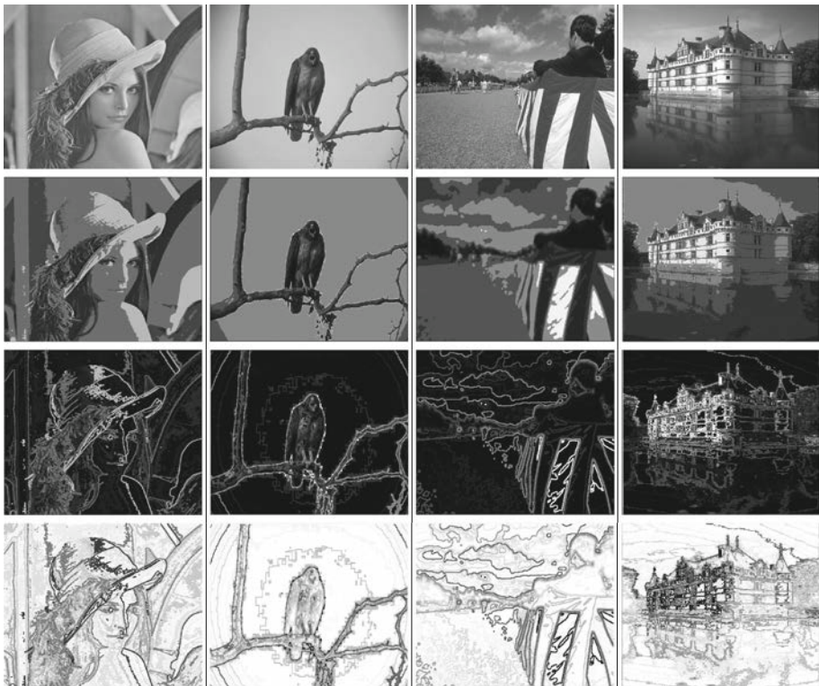
Table 2. Z-coded images using Zeckendorff representation – 1st row shows original images, 2nd row shows quantized images obtained by applying intersection operator, 3rd row contains ultrametric contours obtained by applying set-difference operator and last row shows complemented results of 3rd row

Compared to other local descriptors (see Sect. 1), the Z-coding