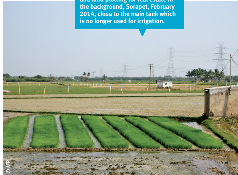
③ Paddy nursery, a shed for the groundwater pump on the right and land plotting for real estate in the background, Sorapet, February 2014, close to the main tank which is no longer used for irrigation.

Besides changes in land and water uses, there have been significant socio-economic changes. Farmers and their wives have changed their secondary activities from agriculture-related activities to small businesses or company laborers. Additionally, almost all the families surveyed had at least one member working in the secondary or tertiary sector. The literacy rate of these families was high with the younger generation mainly being higher educated and less interested in farming. Besides, farm laborers have lost interest in agriculture; they can often get better-paid jobs in urban areas or take part in MGNREGA 9 programs. According to farmers, mechanization is the main result of the labor scarcity issue. The average income for the farmers surveyed was 2,800 rs/acre/month 10 in 2014, which is below the national poverty line of Rs 36,000 of annual income. Marketing agricultural products is the main problem today, because of the high variability in selling prices. Crops are mostly sold through intermediaries. Direct marketing is not common in Sorapet. Of the farmers in our study, more than 50% are members of a farmers' organization; the farmers classified collective action as one of the major platforms to implement future adaptation strategies. The farmers identified a labor shortage, low income and less interest in farming on the part of the younger generation as the key reasons for the decline in agriculture.