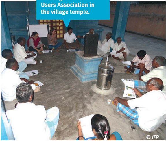
② April 2015: Foresight meeting with Tank Users Association in the village temple.

change would already have played a role. From the foresight scenarios presented, the farmers could prepare their own scenario. The scenarios were discussed in April 2015 (Picture ②) with ten farmers from the Tank Users Association (TUA), a local institution that is liable to support local adaptation to climate change. After the first workshop, the members of this association were interested in going a step further in the process while requesting support to update their strategy. According to the TUA rules in Pondicherry, the TUA board also includes a woman, Scheduled Castes 5 and landless laborers.