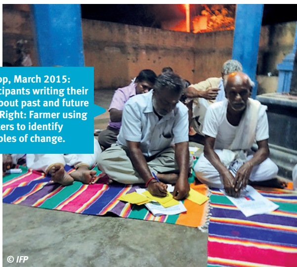
① Workshop, March 2015: Left: participants writing their opinions about past and future changes – Right: Farmer using green stickers to identify main variables of change.