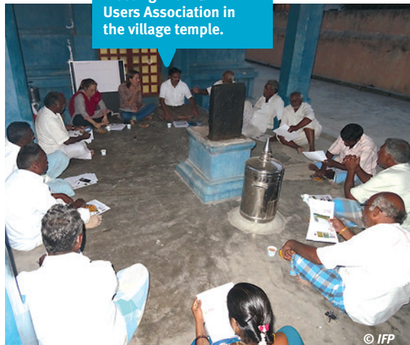
② April 2015: Foresight meeting with Tank Users Association in the village temple.

change would already have played a role. From the foresight scenarios presented, the farmers could prepare their own scenario. The scenarios were discussed in April 2015 (Picture ②) with ten farmers from the Tank Users Association (TUA), a local institution that is liable to support local adaptation to climate change. After the first workshop, the members of this association were interested in going a step further in the process while requesting support to update their strategy. According to the TUA rules in Pondicherry, the TUA board also includes a woman, Scheduled Castes 5 and landless laborers.