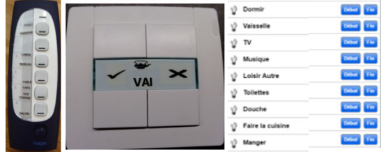
Fig. 2: Interfaces used to annotate the ContextAct@A4H dataset.

(see Fig. 2). The combination of annotation methods allowed the inhabitant to remember easily to do the annotations and minimized interruptions of the activities. The inhabitant annotated the beginning and end of each activity. The inhabitant reported missing some annotations, specially at the end of the second period when there was more familiarity with the environment. This confirms the fact that sensing technology “disappears” when it truly blends with our environments.