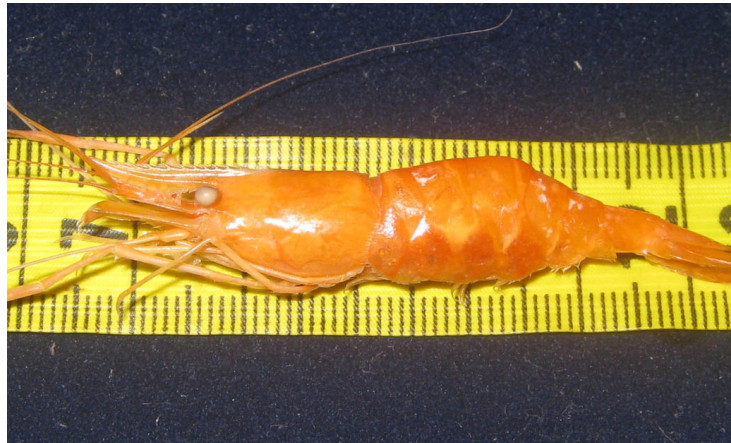
Figure 3. Palaemon macrodactylus Rathbun, 1902 eggs stage III of maturation with visible compound eyes.