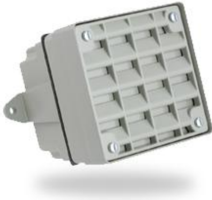
Figure 2. The Mosquito. ( http://movingsoundtech.com/our-products/mosquito-mk4-with-multi-age )