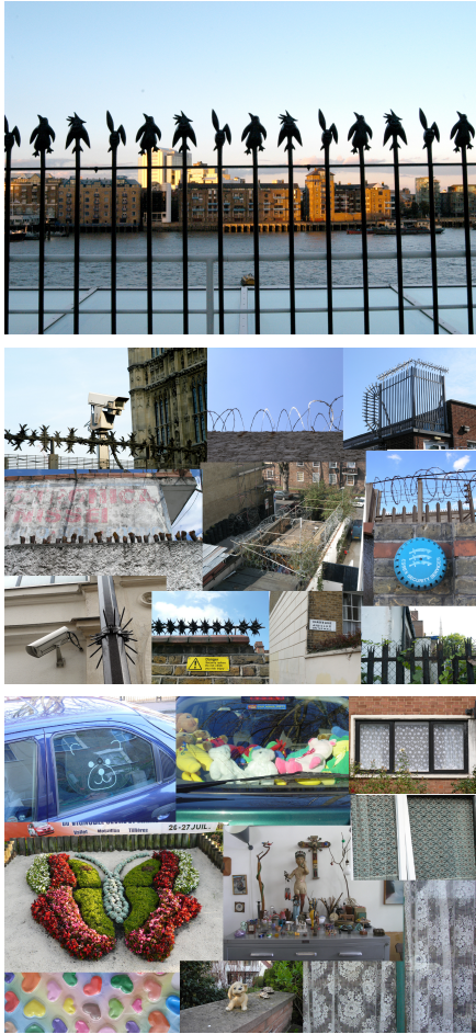
Figure 1. From top to bottom: Matthias Megyeri’s Sweet Dreams Security ® bear-shaped padlock; Megyeri’s animal picket fence; examples of security devices at the boundary of public and private space; examples of cute objects at the boundary of public and private space.