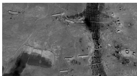
Poultry sheds appearing on "Google earth" aerial images [2012]

The strong and rapid expansion of poultry production units in the Coastal Zone of western desert (Matruh Governorate) and the good performances in term of productivity and mortality have been a surprise for many experts. Four main factors explain this situation: the national market which absorbs all the production; the Bedouin 'quest' in efficient farming systems to face the drought; the lack of specific poultry pathologies in the region; the capacity of the tribe to organization the access to poultry chain. Some other factors have contributed to the expansion e.g. the availability of space for the buildings, the rapid learning of the local labor, and the installation in Marsa Matruh of three feed plants and consultants with skill in poultry production.