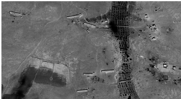
Figure 1. Poultry shed appearing on “Google earth” aerial images.

Observations are based on data collections during farm visits, and interviews with farmers, traders, technicians, veterinarians and feed manufacturers. Identification and georeferencing of poultry farms was done by examination of successive aerial images of the region (2000-2012) available on Google Earth website. Figure 1 shows an image with 6 poultry sheds. They are easily identified on aerial photographs thanks to their typical long shape which correspond to no other buildings in the region of Matruh