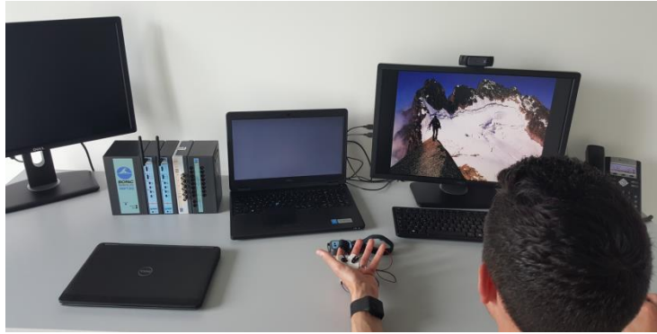
Figure 1. Experiment setup

ry were presented to participants (the selected pictures ID are presented in Appendix 1).