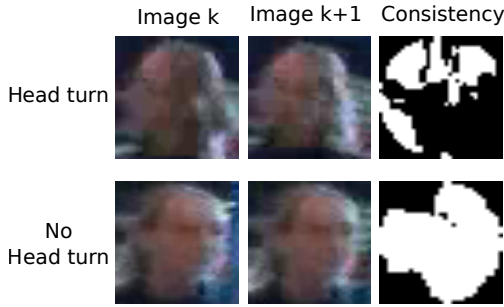
FIGURE 1 – Results of consistency computation.

- Optical flow consistency : most of optical flows methods are not robust to many factors as occlusions, noise, huge movements, etc. One can try to correct false flows (increase computing time) or one can consider only consistent flows. As head turns induce occlusions, which produce inconsistent flows, we consider the percentage of consistent flows to detect head turns.