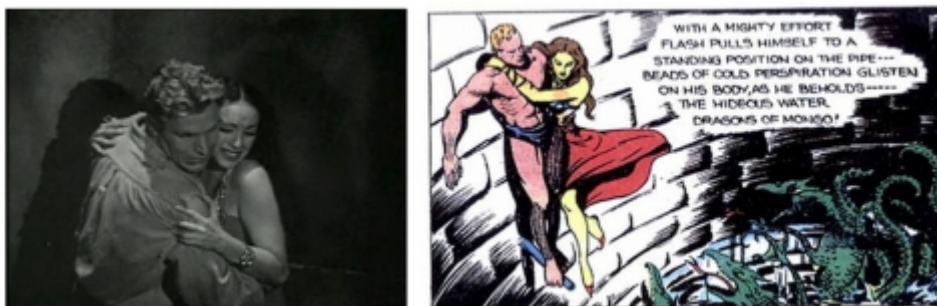
Left: "The Tunnel of Terror", Flash Gordon, Universal, 1936. Right: Alex Raymond, Flash Gordon. All rights reserved.