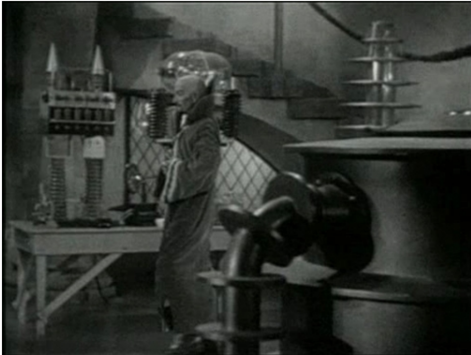
"The Tunnel of Terror", Flash Gordon, Universal, 1936. All rights reserved.

Deep space mise en scène , a rare device in a Hollywood film in 1936.