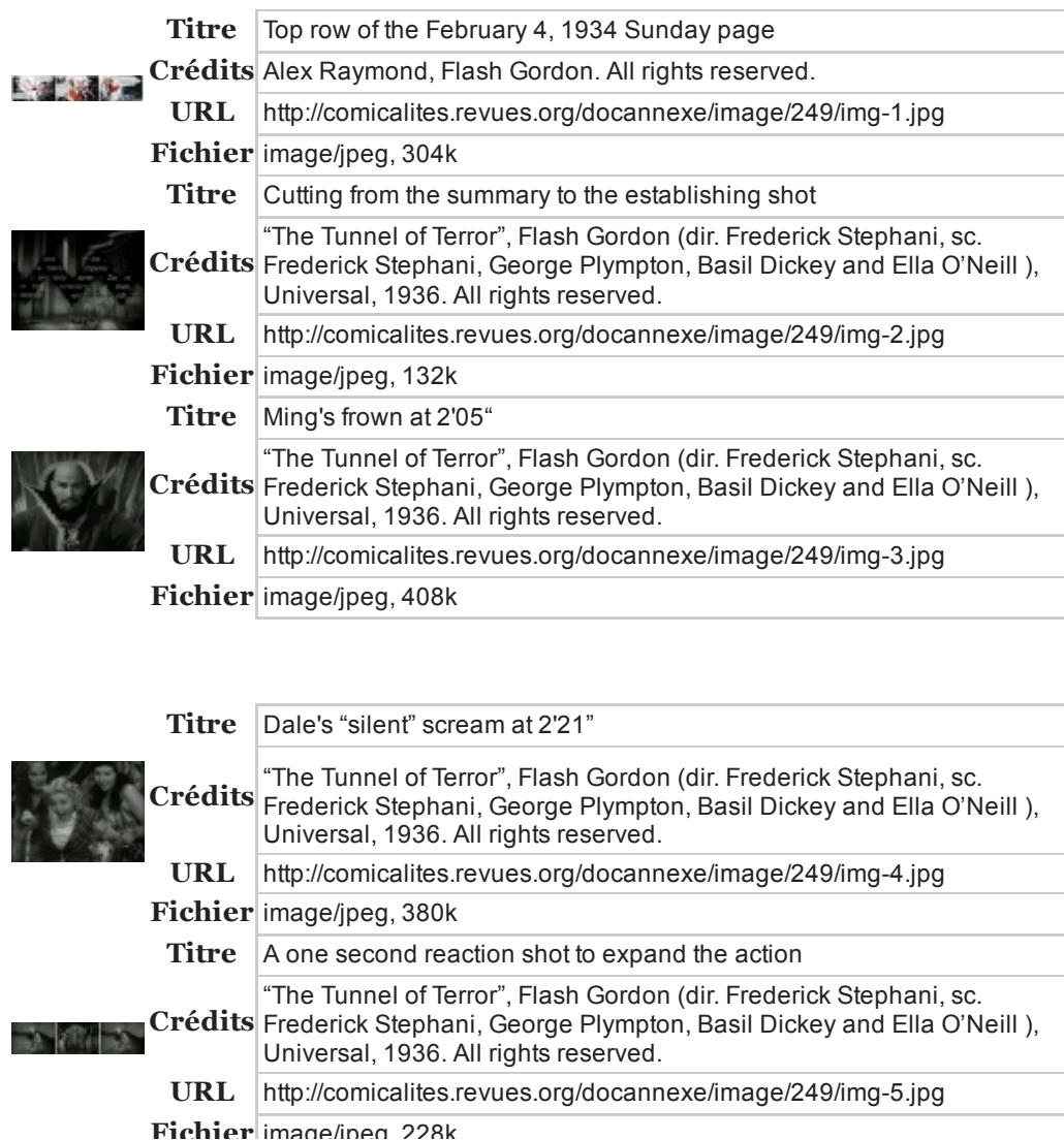
Table des illustrations

23 Cf. TIME, 1938 and LABARRE, 2007, p. 250-2.