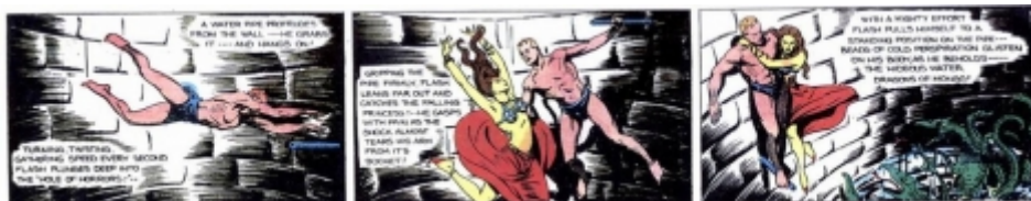
Alex Raymond, Flash Gordon. All rights reserved.