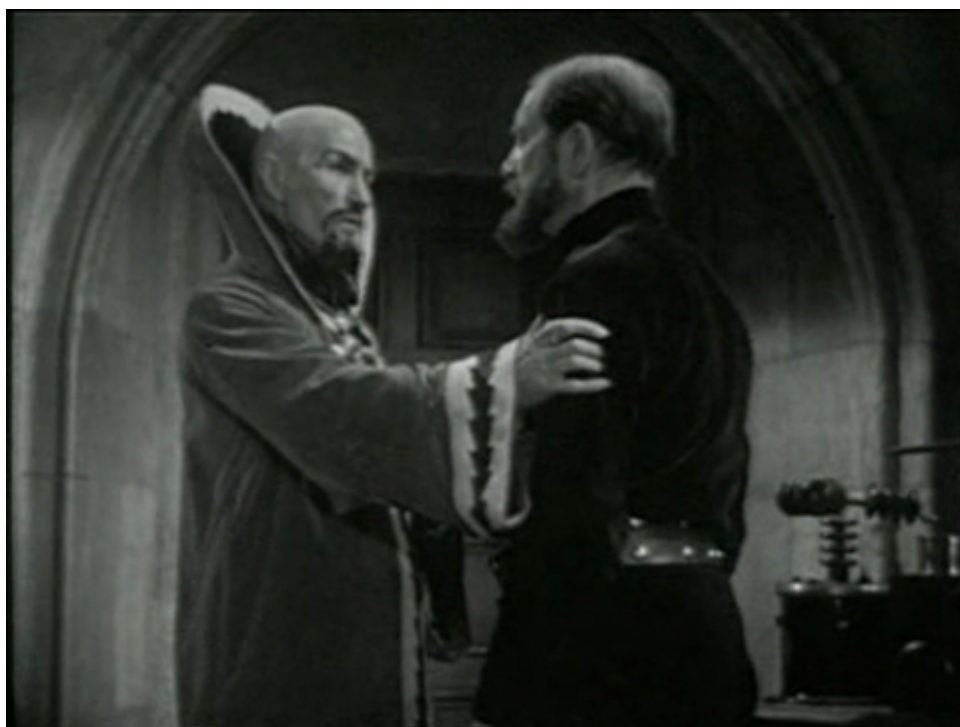
"The Tunnel of Terror", Flash Gordon, Universal, 1936. All rights reserved.