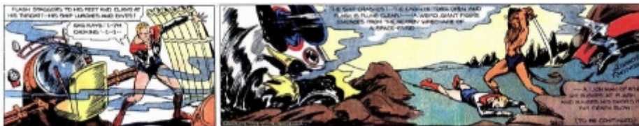
Image 10. Captions help explain a daring ellipsis

Alex Raymond, Flash Gordon. All rights reserved.