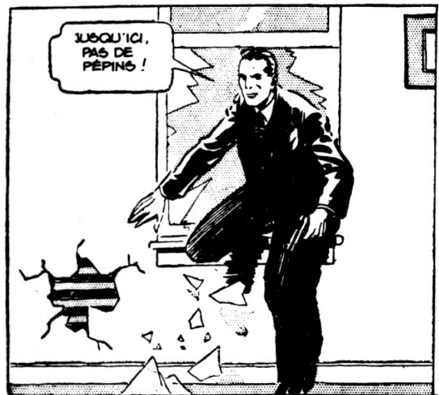
Hammett D. (w.), Raymond A(p.) (1980) Agent Secret X-9 vol. 1 (Paris: Futuropolis). [April 4, 1934:1].

Secret Agent X-9 , is a detective comic strip, which resorts to the form of conventional "realism" to be expected from a narrative based on that specific genre. In the strip, thugs are burly, gangsters are slick and ladies are predictably elegant. I would like to suggest that in establishing and maintaining that "realism", Raymond had to contend with a number of conventions and constraints, for which he briefly chose an unusual solution: highly detailed figures positioned in front of spatial markers which are highly geometrical and conventional yet never omitted. The fact that he abandoned this option after less than a year on the strip suggests that the resulting tension did not go unnoticed. While it may have been undesirable in the context of such genre-based entertainment, this tension can be put to use in different type of works, in which ten-