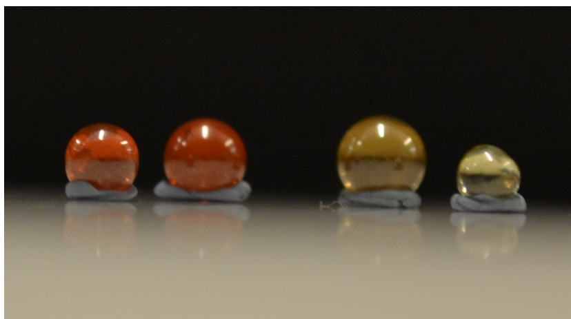
Fig. 1. Spin ice spherical crystals. From right to left \text{Dy}_2\text{Ti}_2\text{O}_7 sample A and sample B; \text{Ho}_2\text{Ti}_2\text{O}_7 sample C and sample D. Each sphere has a diameter ranging between 3 to 4 mm.