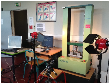
Figure 1: Test device

Numerous 3D calculation tools allow to perform such simulations, but the field of furniture presents some specificities. On the one hand, the furniture elements generally have simple geometry and then can be assimilated to an assembly of plates and/or beams. On the other hand, (i) the material properties of particle boards exhibit strong variabilities due to their heterogeneous and anisotropic behaviors, and (ii) the connections between the different furniture parts can be complex and may induce some non-linear local effects that cannot be represented by simplified models based on plate or beam theories.