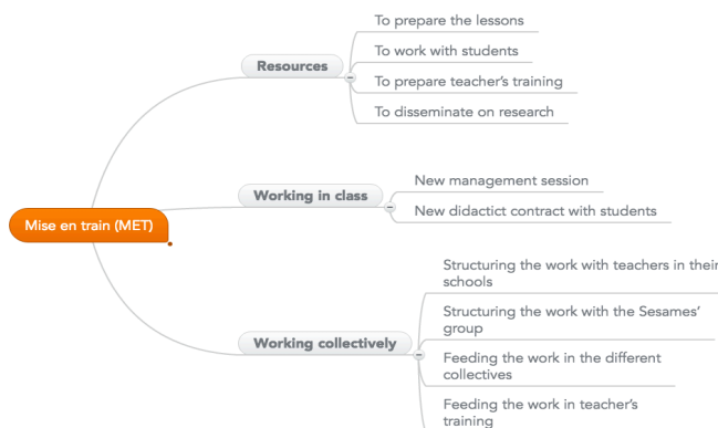
Figure 4. The impact of MET on Anna's documentation work

Once created, MET deeply changed Anna's documentation work (cf. Figure 4). It affects all five structuring features of classroom practice. The working environment change, for example, students entering class lately do not disturb class activity. The activity format also is altered, because the class is divided in two moments: MET vs. main course.