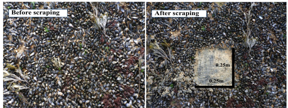
Figure 2. Photo showing mussel beds before and after scraping a 1/16 m 2 quadrat at Sainte-Honorine-des-Pertes.

on 9 August in Sainte-Honorine-des-Pertes, on 26 August in Villers-sur-Mer, and on 2 September in Lion-sur-Mer (2 September). At each site, estimates of crab abundance were based on six replicate 1/16 m 2 quadrats [0.0625 m 2 ] placed haphazardly, and densities reported as number of individuals per m 2 . Mussel beds were sampled by scraping all the mussels off of the rocks with a spatula, and the scraped surface was brushed to avoid missing organisms (Figure 2). The samples were stored in plastic bags and transferred to the Marine Station of Luc-sur-Mer. Live crabs were removed from the samples immediately after arriving in the laboratory, and then fixed in alcohol before being measured.