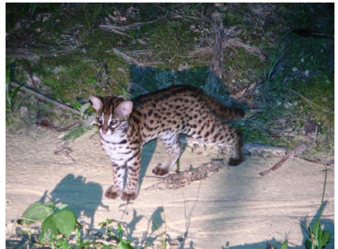
Fig. 6. A leopard cat ( Prionailurus bengalensis ) foraging in an oil palm plantation during night time, 2012, Indonesia, Aude Verwilghen ©Cirad.

contrary, intensive rodenticide applications could not prevent high levels of rat damage. What can we learn from the analysis of rat predators’ community that might explain the contrasted efficiency of rat control?