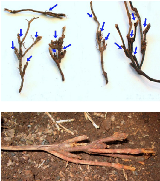
Fig. 7. Oil palm roots showing traces of successive reiterations right from an early stage due to Sufetula attack, Xavier Bonneau ©Cirad.

when oil palms are grown on peat soil, whereas the oil palms display a relatively healthy root system in an infested area on mineral soil (Beaudoin-Ollivier et al. , 2011). This pest pressure on the root systems of oil palms in plantations on peat has a negative effect on the physiology of the palm through progressive exhaustion. Indeed, when caterpillars attack the roots, these roots generate new apices nearby the point of attack and the palm spends too much energy regenerating a continually attacked root system to the detriment of the aerial parts (fronds responsible for photosynthesis and bunches ensuring yields) (Fig. 7). The balance of carbon and energy partitioning between the different organs of the palms is thus changed (Bonneau et al. , 2007).