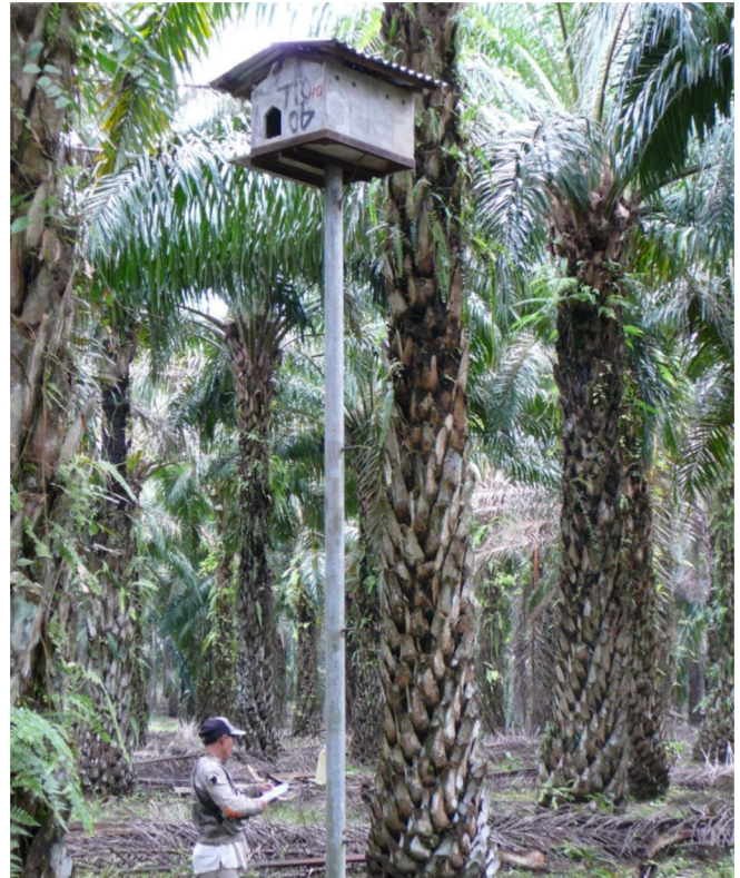
Fig. 4. A nest box for barn owls ( Tyto alba ) in oil palm plantation, 2010, Indonesia, Aude Verwilghen ©Cirad.

Rodent pests are a major source of crop damage worldwide, hereby highly impacting food security (Singleton et al. , 2010; Stenseth et al. , 2003). In South-East Asia, rats are invasive pests in oil palm plantations, causing significant damages (Turner and Gillbanks, 2003; Wood and Liao, 1984). Estimated potential loss may reach up to 10% of the production (Liao, 1990; Wood and Chung, 2003). Rats feed predominantly on the pericarp of oil palm fruit, whether directly on the fruit bunches on the palms or on loose fruit that fall to the ground when ripe; they are also found to eat apical tissues of oil palm seedlings in the nursery, as well as the petiole bases of immature palms; in addition, they also supplement their diet by feeding on the pollinating weevil Elaeidobius kamericus , thereby affecting pollination success and fruit setting (Chiu et al. , 1985; Chung, 2013; Wood, 1976). In oil palm plantations in South-East Asia, three species are dominant and represent