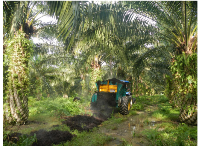
Fig. 3. Field application of compost from palm oil residues, 2013, Indonesia, Cécile Bessou ©Cirad.

P.T. SMART Tbk., Indonesia, has carried out several composting trials since 1997 in order to identify the most interesting compositions and the best processing strategies. Results showed that it is possible after 14 weeks of composting to reduce the initial volume and weight of EFB by 80% and 55% respectively. Moreover, the high initial carbon to nitrogen (C/N) ratio in EFB can be decreased by addition of nitrogen-rich content products like urea or mature compost, which improves the activity of microorganisms for a faster