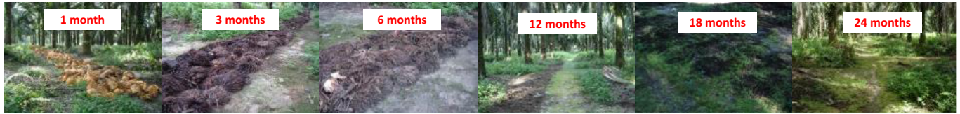
Fig. 2. EFB decomposition in the field: 1, 3, 6, 12, 18 and 24 months after application. EFB decomposition leads to an improvement of global soil quality, showing, among other improvements, higher soil macrofauna abundance and soil organic carbon content, Indonesia, Marc-Philippe Carron ©Cirad.

hectare per year, EFB can be used as total substitutes for K/Mg for some 10% of the plantation but still complemented with mineral nitrogen and phosphate. Besides the nutrient inputs, EFB can also further improve physico-chemical properties of the soil. Short-term and long-term studies (10 years application) showed an improvement of soil chemical quality through the following indicators: soil organic carbon, total nitrogen, CEC, and available phosphorus (Abu Bakar et al. , 2011; Caliman et al. , 2001; Comte et al. , 2013). EFB application can also improve some physical properties of the soil related to both the addition of soil organic carbon and physical mechanisms such as the mulch effect. Those allow for better soil permeability (Caliman et al. , 2001; Carron et al. , 2015b), higher water retention at field capacity, better soil aggregate stability and hence lower erodibility (Moradi et al. , 2015; Zaharah and Lim, 2000).