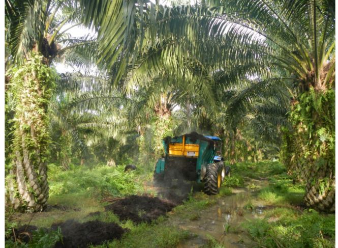
Fig. 3. Field application of compost from palm oil residues, 2013, Indonesia, Cécile Bessou ©Cirad.

P.T. SMART Tbk., Indonesia, has carried out several composting trials since 1997 in order to identify the most interesting compositions and the best processing strategies. Results showed that it is possible after 14 weeks of composting to reduce the initial volume and weight of EFB by 80% and 55% respectively. Moreover, the high initial carbon to nitrogen (C/N) ratio in EFB can be decreased by addition of nitrogen-rich content products like urea or mature compost, which improves the activity of microorganisms for a faster