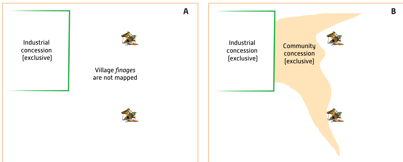
A. In general, this is the prevailing situation. Only industrial concessions or protected areas are recognised as territorial institutions. Villages are recognised only as residential areas.