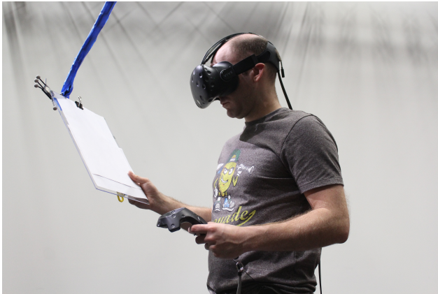
Figure 2. Picture of an user using the Virtual Notepad.

An optical tracking system tracks it. In the simulation, the document is attached to the position of the board.