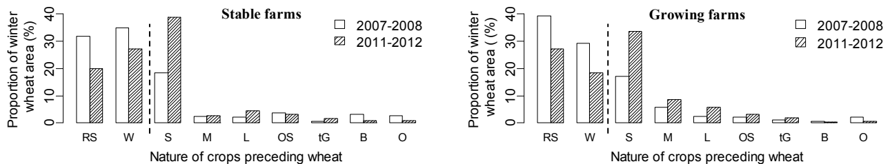
Fig. 2. Proportion of wheat area associated to each type of preceding crops on stable farms (n=61) and growing farms (n=30) (RS, W: intensive preceding crops / S, M, L, OS, tG, B: extensive preceding crops). Sources: RPG (2007-2008 and 2011-2012).

RS: rapeseed, W: winter wheat, S: sunflower, M: maize, L: legumes, OS: other oilseed-crop, tG: temporary grassland, B: barley, O: others.