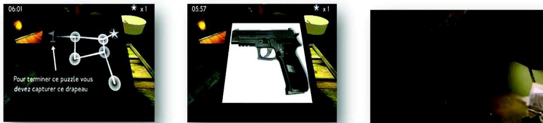
Figure 3 - Clues game: The player had to play Puzzle while main character in the TV show found the same clues.

Eight participants, five male, three female, aged 16 to 26 with a mean age of 22 years, took part in the study. The size of the eight households in which the participants lived ranged from one to four members. Participants reported that they played video games regularly on a multitude of devices. Seven participants reported that they had IPTV at home (covering all major operators in the country). Six participants reported watching TV (on a TV screen) at least several times per week, one reported watching once per week, one reported to watching once per month.