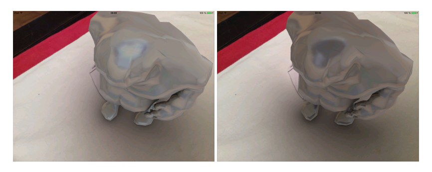
Figure 4: Results with dynamically updating envmaps.

SUGANO, N., KATO, H., AND TACHIBANA, K. 2003. The effects of shadow representation of virtual objects in augmented reality. In Mixed and Augmented Reality , 2003. Proceedings. The Second IEEE and ACM International Symposium on, 76–83.