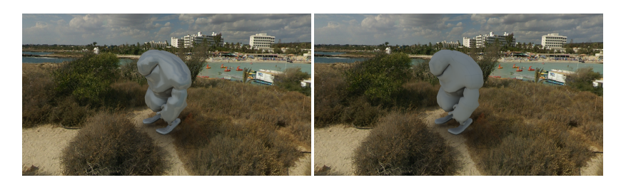
Figure 2: Result of our image based lighting method. Left: glossy BRDF. Right: diffuse BRDF.

law with exponent s, the corresponding mipmap level m is given by (see paper for details):