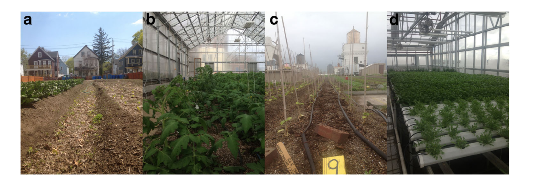
Fig. 1 a Ground-based-nonconditioned, b ground-basedconditioned, c buildingintegrated-non-conditioned, and d building-integrated-conditioned systems in the Northeastern USA.

Figure 2a–c outlines a comparison of the material and energy needs of ground-based-non-conditioned, ground-based-conditioned, building-integrated-non-conditioned, and building-