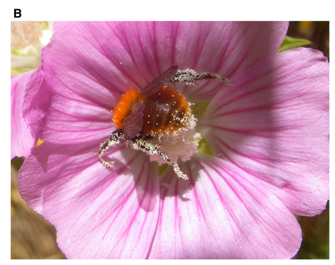
Fig. 2 Weeds such as the annual tree mallow, Lavatera punctata All. (Malvales: Malvaceae), are abundant sources of pollen and nectar for many insects, including bumblebees (Hymenoptera: Apidae), such as a the red-tailed bumblebee, Bombus lapidarius (L.), and b the common carder-bee, Bombus pascuorum (Scopoli)

poppy, P. rhoeas L. (Papaveraceae), a completely self-incompatible species, has no nectaries, and pollen is the only reward for visiting insects (Thomas and Franklin-Tong 2004). In intensive cereal landscape, poppies can account for up to 60 % of pollen resources for honey bees during late spring, in June (Odoux et al. 2012; Requier et al. 2014).