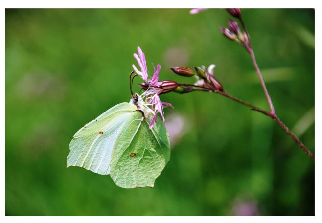
Fig. 5 Some weeds, such as Lychnis flos-cuculi L. (Caryophyllales: Caryophyllaceae), are slender with flowers at the apex. During foraging, the weight of the butterfly (here, a Pieridae, Gonepteryx rhamni (L.)) bends the stem so that the flower opening points downwards. The insect movements thus enable the pollen to be detached from the floral parts and to adhere to the insect's body

activity decreased frequency and duration of pollinator visits by direct attacks or indirect effects due to presence of chemical signals. Nectar robbers that extract nectar through a pierced corolla tube, avoiding contact with anthers and stigmas, are also poor pollinators. A good example is Bombus occidentalis Greene (Hymenoptera: Apidae) which visit Linaria vulgaris Mill. (Scrophulariaceae) to collect nectar, poking holes in the corolla without penetrating inside (Maloof and Inouye 2000; Newman and Thomson 2005).