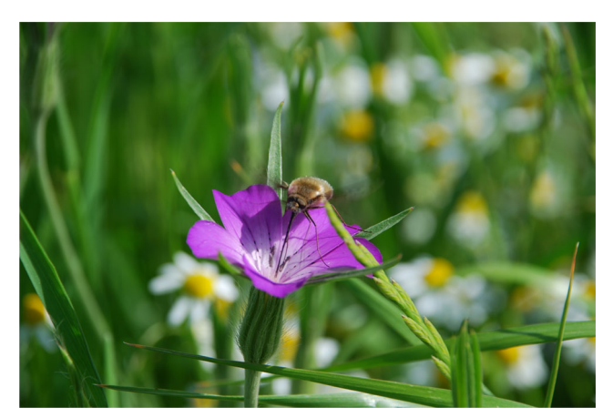
Fig. 4 Bee flies (Diptera: Bombyliidae) hover in close proximity to flowers, thus reducing the chances of pollen grains adhering to their bodies: here, a flower of Agrostemma githago L. (Caryophyllales: Caryophyllaceae) visited by Bombylius fulvescens Wiedemann

Coulter and Dipsacus fullonum L.) and Caryophyllaceae ( Agrostemma githago L. and Silene spp.). Overall, the pollen transport by butterflies seems to be less efficient than by Hymenoptera (Jennersten 1984). Particular mechanisms may enhance it. For instance, some weeds (e.g., Lychnis flos-cuculi L. (Caryophyllales: Caryophyllaceae)) are slender with flowers at the apex. During foraging, the weight of the butterfly (e.g., Pieridae, such as Gonepteryx rhamni (L.)) bends the stem so that the flower opening points downwards (Fig. 5). The insect movements thus enable the pollen to be detached from the floral parts and to adhere to the insect's body (Benelli G., pers. observ.).