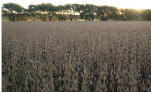
Fig. 1 Soybean field before harvest in the Argentinean Pampa, April 2013