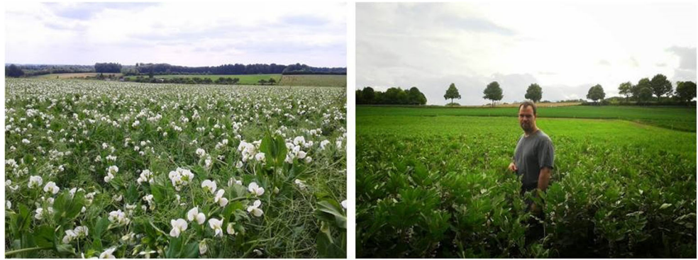
Fig. 1 Farmers' interest in grain legumes is high, but there is a huge gap of knowledge about these crops

farms with over 5 ha arable land; a total of 1373 farmers were contacted. The criterion to send the survey only to farmers who manage more than 5 ha guaranteed that part-time farmers are not overrepresented. To protect anonymity, the questionnaire was mailed by the “Service d'Economie Rural (SER)” of the Ministry of Agriculture, Viticulture and Consumer Protection (MA). A reminder was sent to the farmers in November 2012. The questionnaire was sent again 6 months after first distribution, in February 2013 (Dillman 1991).