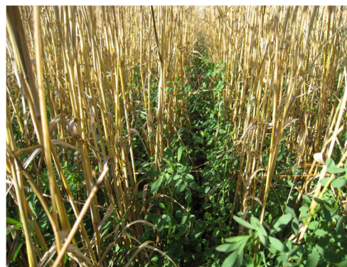
Fig. 1 Field-focused intensification: relay intercropping of wheat and undersown lucerne in south-eastern France. Lucerne is an interesting intercrop to be undersown in cereals for N-fixation and providing increased soil cover for weed competition during cereal cropping and afterwards. It can also be harvested as forage because of its high fodder value

To solve these issues, many stakeholders in food production are advocating for an ‘intensification’ of agriculture. The proposed solutions vary from radical food system changes to smaller field-focused improvements (e.g. Clay 2011; Foley et al. 2005; Royal Society London 2009) (Fig. 1). A variety of terms have emerged referring to general or more specific concepts and approaches to solve these issues. The present three major intensification concepts are ‘ecological