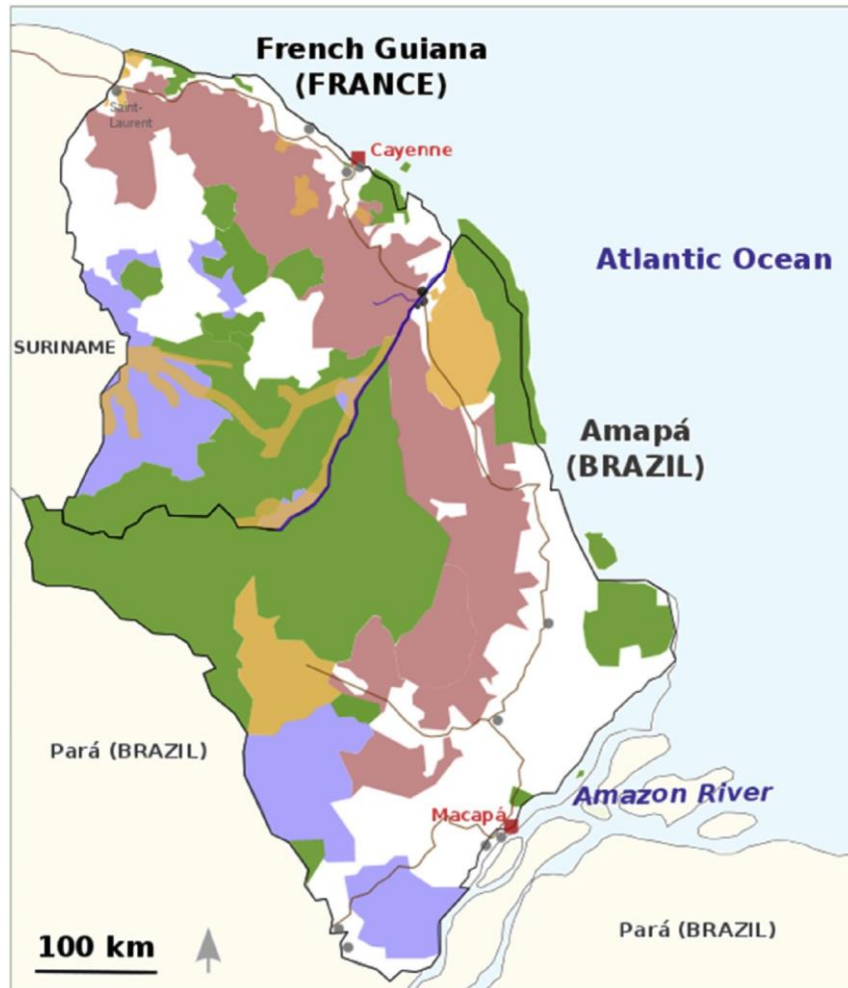
Fig. 3. Map of protected areas management categories in Amapá and French Guiana. (Strictly protected areas = S.P.A. ¼ dark green; Tribal protected areas = T.P.A. ¼ Orange; Local development areas = L.D.A. ¼ Blue; Sustainable Forest Management Area = S.F.M.A. ¼ Red). (For interpretation of the references to colour in this figure legend, the reader is referred to the web version of this article.)