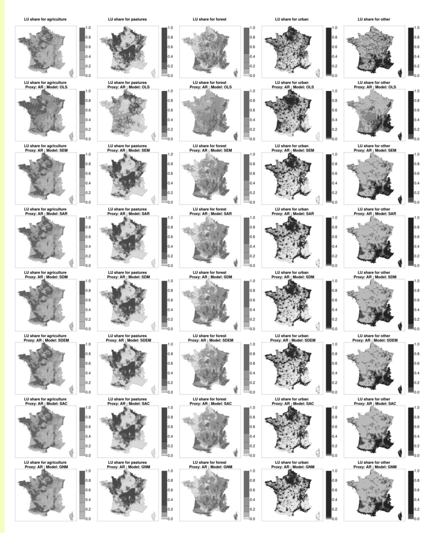
Figure B2: Observed land use shares (top row) and predicted. Proxy for the agricultural rent: farmers' revenues; in-sample fit (dependent variables known)