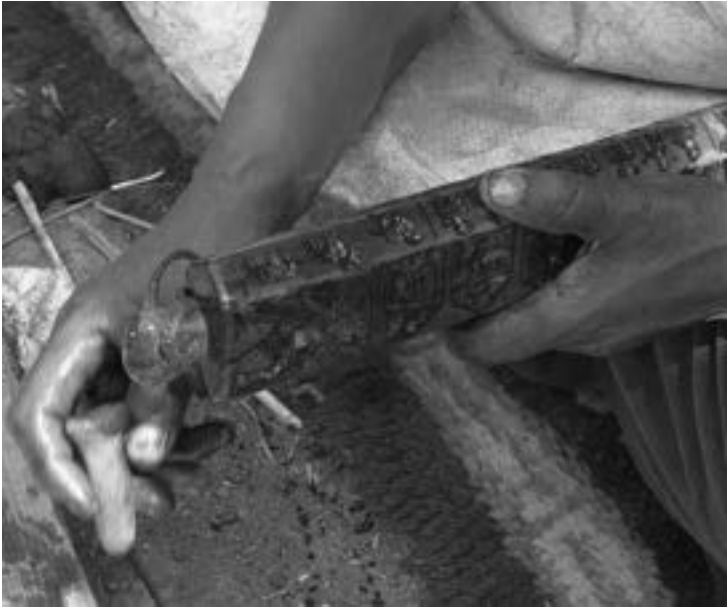
Fig. 3. Lama Tshultrim of Lubrak prepares to make a dough print ( zan par ) of the camel (third image from left) for use in a performance of the Three-headed One from the Black Rituals ( gTo nag mgo gsum ).

for portents, there is nothing more portentous than this: it is the demon of degeneration that brings low the thrice-thousand worlds; the demon of downfall that destroys kingdoms – the mighty one that will bring an end to ill omens. Its energy is as great as that of the wrathful gods; its strident roar is (21v) as loud as the thunder; from its mouth spew forth a host of impurities, and its neck is hung with diverse adornments. A myriad offerings for the gong po demons are loaded on its back. I pray you, repel all the various ill omens! 12