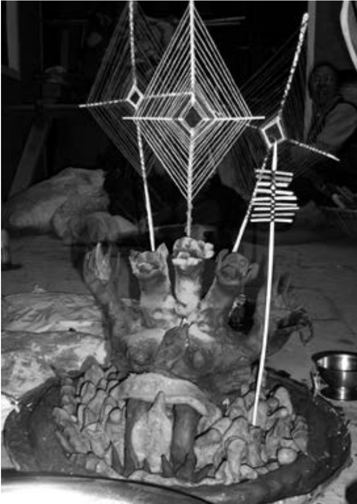
Fig. 4. Effigy of the Three-headed Black Man ( Mi nag mgo gsum ) under construction in Lubrak, Nepal.

visible in front of the camel's ears is a pair of horns. While we might be inclined to attribute this curious feature to the likelihood that the wood carver had never seen a camel, a more compelling explanation is provided