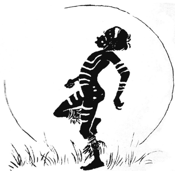
Figure 2. Early drawing by Elizabeth Durack of an aboriginal child (1935) (Durack and Durack 1935).

These new works are the apogee of Elizabeth’s life work. They were presented to the world as the work of a previously unknown artist named Eddie Burrup. Eddies are currents that run counter to the main currents and this Eddie ran true to type. Swept away by the Eddies was the cute sentimentality, bordering on kitsch, of Elizabeth’s early marginalia (Durack and Durack 1935; Durack and Durack 1940) (Figure 2). With those cherubic aborigines of Elizabeth’s past, she was perhaps at risk of being categorized along with Brownie Downing (1924–1995) as a creator of Aboriginal-themed kitsch. Downing had commercialized Elizabeth Durack-style ‘piccaninnies’ (Durack and Durack 1940) into a prolific cottage industry of gift cards, porcelain plates, decorative plaques, children’s books and tea sets (Higgins 1995). For Downing it was a marketing exercise. For Durack it was a lived experience.