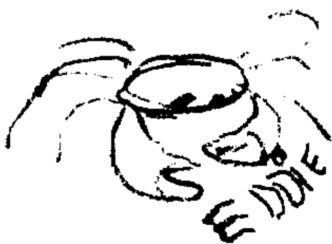
Figure 5. The rock crab mark of Eddie Burrup (Durack 1997).

With 40 works produced in his first ten months, Eddie was prolific: “Whither Eddie Burrup? God only knows. I have been working with him all day down in the rear studio. We completed a new composition... and then named most of the paintings and signed them with Eddie’s mark—a little rock crab—on the back (Figure 5). There must be about 40 pieces there now. Some better than others but some very good... The work I have been doing, apart from Eddie, seems so tame and insipid... Eddie Burrup is the ultimate in a prison of the imagination” (Clancy 2016, 1995 diary, pp. 221–22).