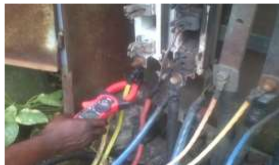
Figure 3: Reading being taken from one of the substation feeder pillar.