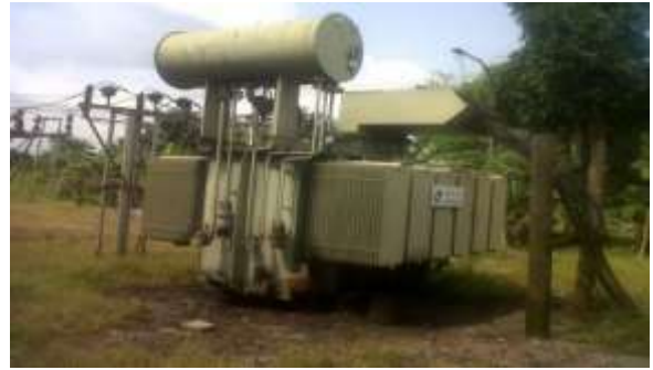
Figure1: Photo View of U-15, 15MVA, 33/11kV Injection Substation.

Ughelli- 15, 15MVA, 33/11kV injection substation, has a communication name (U-15) which has a common boundary with Transcorp Power Generating Station, at KM 20 Ughelli – Patani Express Road, Ughelli, Delta State, Nigeria. Ughelli-15, 15MVA, 33/11kV injection substation gets its power supply from a 33kV transmission line via Transcorp Generating Power Limited, Transcorp generating power plant generates at 16kV and its been fed into a 30 MVA, 132/33kV transformer, which stepped up the 16kV to 132/33kV the output which in turn feeds the Ughelli-15, 15 MVA, 33/11kV Injection Substation. The Injection Substation and generating station have common boundary and are both interconnected with conductor size of 150mm 2 cross sectional area, and from Ughelli-15, 15MVA, 33/11kV injection substation to its various distribution substations are connected also with conductor size of 150mm 2 conductors.