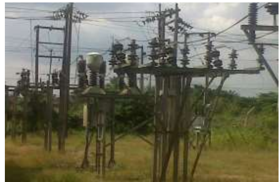
Figure 2: Photo View of U-15, 15MVA, 33/11kV Injection Substation.