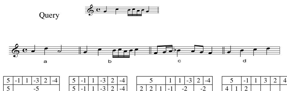
Figure 2 The top query matches fully with instances (a) and (c), matches partially with instance (b) except for the last interval, and, in case (d), only the first two intervals match with the first interval of the query (solid line tables indicate matches).

Let us examine one musical example (Figure 2) in more detail. According to our proposed interval consolidation and fragmentation operations (see tables in Figure 2), the top melodic query matches fully with instances (a) and (c) in agreement with standard musical knowledge/intuition (actually the query and instance c are elaborations of instance a). The query matches partially with instance b (except for the last interval). Finally, only the first two intervals of instance d match with the first interval of the query; this is the weakest match. These match results are rather plausible according to our general musical understanding.