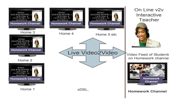
Fig.2. Interactive Homework Channel

provider (as shown in Fig.2). The purpose is to assist and enhance homework activities. An authentication system will be included with the homework channel to support privacy. Extensive technical and usability testing and reporting will be conducted following the implementation of the selected uses cases to schools. The analysis will be based on questionnaires, as well as ad-hoc research activities.