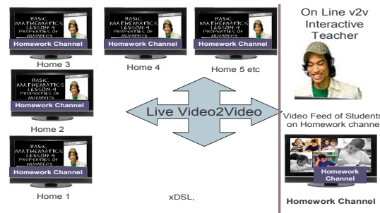
Fig.2. Interactive Homework Channel

provider (as shown in Fig.2). The purpose is to assist and enhance homework activities. An authentication system will be included with the homework channel to support privacy. Extensive technical and usability testing and reporting will be conducted following the implementation of the selected uses cases to schools. The analysis will be based on questionnaires, as well as ad-hoc research activities.