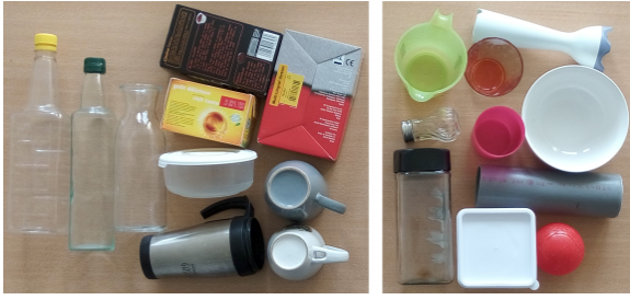
Fig. 2. Disjoint training (left) and test (right) object sets.