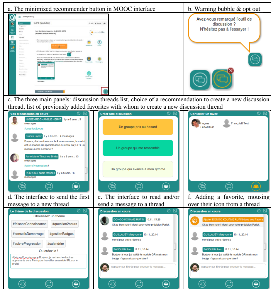
Fig. 2. The peer recommender and chat widget: implementation and design