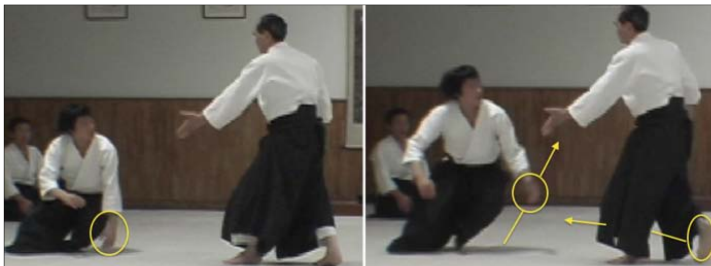
C: keep his left arm extended A: moves forward with his left foot and raises his left hand