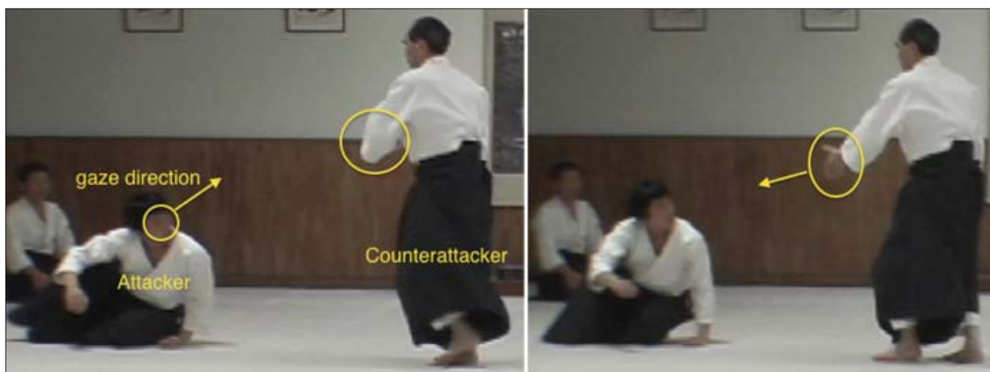
A: orients gaze toward C and keeps gazing toward him C: moves forward with his left foot and extends his left arm > 20.6 A: stands up > 20.73