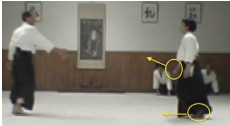
C: keeps right hand raised while moving right foot one step forward A: moves left foot forward one large step and raises his right hand