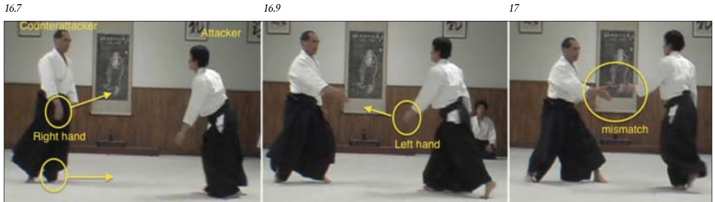
C: raises his right hand and keeps it raised A: raises his left hand

The attacker, A, is on the right. The counter-attacker, C, is on the left.