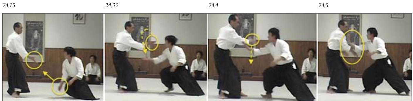
C: raises his right hand A: raises his right hand toward the counter-attacker C: makes a quick up and down cutting gesture

The attacker, A, is on the right. The counter-attacker, C, is on the left.