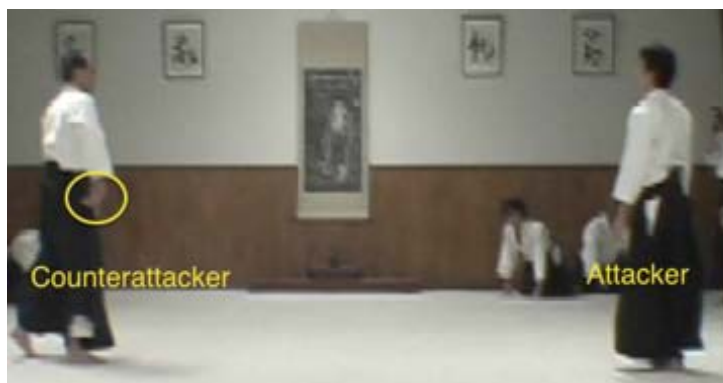
C: moves left foot one step forward and raises right hand A: moves left foot forward one large step and raises his right hand