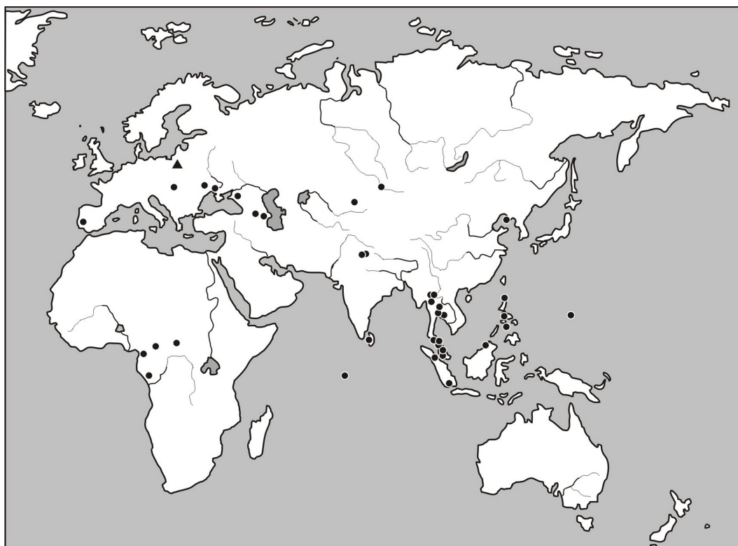
FIGURE 3: Distribution of Blankaartia acuscutellaris (Walch, 1922). Records after Kudryashova (1983, 1998), Fernandes and Kulkarni (2003) and Ripka and Stekolnikov (2006) indicated with dots; the new, northernmost record, indicated with triangle.

Floodplain meadows and fens, being typical habitats of the new host species, the great snipe, match the published information on the preferred habitats of B. acuscutellaris which comprise wet, temporarily inundated places, including river banks and swamps (Ripka and Stekolnikov 2006). This is of special importance in view of the further development of the mite, which involves predatory deutonymph and adult, as well as calyptostatic protonymph and tritonymph. The partial engorgement of the larvae of B. acuscutellaris collected from the great snipe Gallinago media indicates that the mites may have been attached to the host for a relatively short time; on the other hand, the healed scars observed on the host's skin, most likely denoting the places already left by other larvae, may suggest that at least some individuals may have managed to complete the parasitic phase. This supports the hypothesis of time-lagged parasitism already known in the Trombiculidae and explained by prolonged infestation in Hirsutiella zachvatkini (Moniuszko and