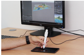
Figure 5: Different input methods are combined to improve workflow.

A module consists of two nested 3D-printed cylinders. The inner cylinder contains the electronic parts and fits into the outer shell to form the final module ( 18mm ). We built a set of 15 modules, including various input modules such as a buttons, a mouse wheel, an accelerometer, a touch sensor and a microphone. Output modules provide visual feedback, through RGB LED modules, or haptic feedback via a vibro-motor. The tip of the pen is conductive to support compatibility with a capacitive screen and is sensitive to pressure. The form factor results from a compromise to achieve sufficient rigidity while enabling a comfortable grasp. Each module encloses electronic parts.