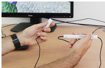
Figure 6: VersaPen used as a game controller.

We implemented a simple flow-based programming interface in order to let end users to connect the various input and output sources to computer applications through visual