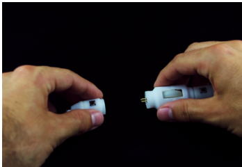
Figure 2: A user stacking input modules to create a customized digital pen.

Pen augmentation has been proposed to alleviate the problem of mode switching, such as switching between drawing, annotating and issuing commands, or more generally for selecting modes [1]. To achieve this, various input modalities have been considered [2]. Studies also considered different output modalities, such as visual or haptic feedback [3]. VersaPen not only embeds many of these I/O modalities, but also allows users to rapidly prototype and customize devices by combining them.