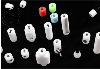
Figure 1: Set of modules composing the pen, including sensors and displays.

mice or stylus remain mostly static. They have few input and output capabilities that users can seldom customize for adapting these devices to their tasks and applications.