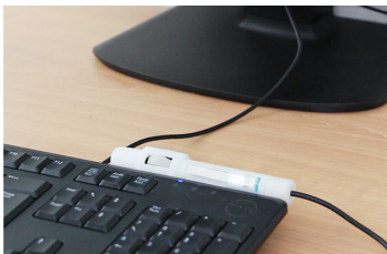
Figure 8: Modules can expand input capabilities of existing devices (here a keyboard).

VersaPen can also serve as an auxiliary device of an existing device or application to provide additional feedback. For instance, a 2D data visualization application can take advantage of the LED module to convey additional information (Figure 7). VersaPen can also extend the capabilities of another device as shown in Figure 8 where VersaPen is used to extend a keyboard. The slider module of the pen allows to scroll content without moving the hands from the keyboard.