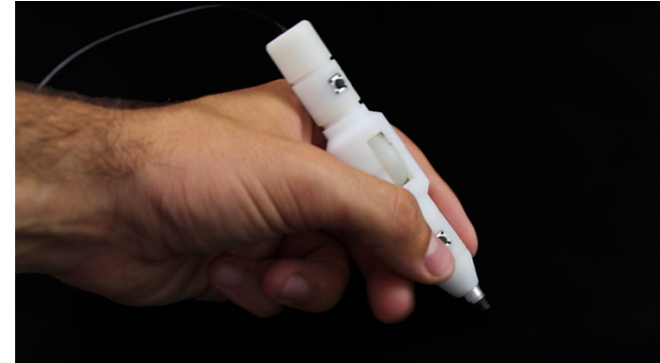
Figure 3: VersaPen has the same form factor as traditional pens.

Tangible User Interfaces (TUIs) aim at the customization of physical interfaces. Toolkits have been proposed to quickly prototype physical interfaces [4]. However, the target users are developers or product designers rather than the end users who will manipulate these devices. In contrast, MagGetz [5] proposes a set of user-customizable physical controls but their form factor (size and shape) is not appropriate for pen-based interaction.