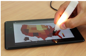
Figure 7: Additional information is displayed on the LED module.

Editing applications typically offer many commands that are organized in palettes and toolbars that tend to hide a large part of the workspace. VersaPen solves this problem by letting users assign a subset of useful functionalities to appropriate VersaPen modules. We used this capability in a drawing application featuring a novice and expert mode to save screen real-estate. In novice mode, turning the wheel of the pen temporarily displays a palette and the user can navigate between commands by turning the wheel. In expert mode, the same action is performed without waiting for the palette to be displayed on the screen. Moreover, the haptic and LED modules can serve to provide feedback about the current tool.