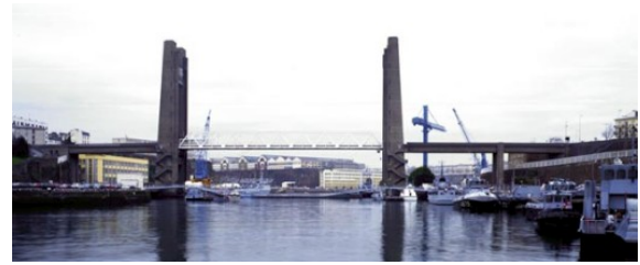
Figure 3. Object characterized by three Dimensional entities : Topos : Brest, Chronos : XX th century, Thema : Bridge