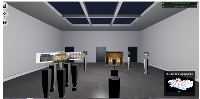
Figure 1. Growing virtual museum

Many works in e-commerce and data exploration focus on finding ways to adapt information representation according to user's center of interest. Almost of these approaches estimate this center of interest from informations consulted during navigation. [10] propose to classify users among three categories : expert, medium, beginner. Each category is associated with a level of information details to be presented to the user, as well as with a specific navigation mode. The system defines and changes the user category by analyzing the information that he consults. [8] present a web site dedicated to scheduling. It allows suggestions according to user's center of interest. These centers of interest are determined from the sites that were previously visited. One similar approach is proposed by Cecilia di Sciascio in [3]. It consists to not only