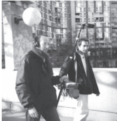
Fig. 1: Walking, listening and describing.

The listening subject is fitted out with two systems of synchronised recording equipment: