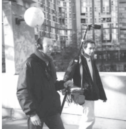
Fig. 1: Walking, listening and describing.

The listening subject is fitted out with two systems of synchronised recording equipment: