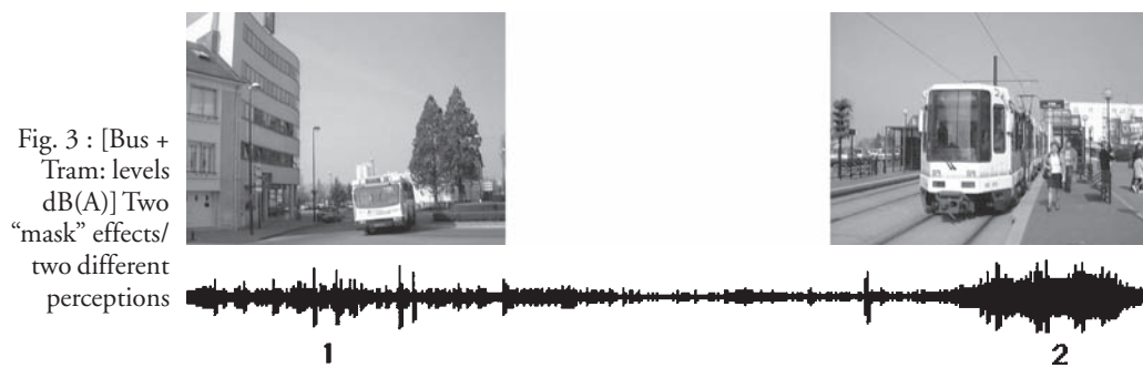
Fig. 4 : Cross-referencing of different types of material (extract)

To illustrate this method, here is a simplified example of two “mask” effects on a short sequence taken from the Nantes study (Rez  ). The participant walks along a two lane road lined with low buildings, skirts a rather busy roundabout, walks away from it, then along a pavement, to finally enter an open-space where there is a tram stop.